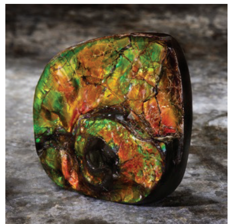
Classic freeform ammolite hand specimen demonstrating the most common colors—red, orange, and green.