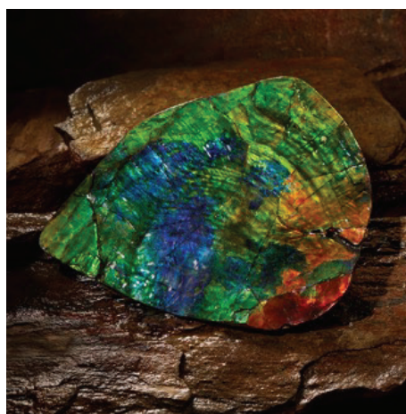
Mesmerizing – One-of-a-kind ammolite hand specimen showing all the colors of the rainbow.

In ammolite, the rarest colors are pink, violet, and blue, whereas red, orange, and green are the most common. Gems are sought after that display the full spectrum. Those that display the rarest colors have a higher value.